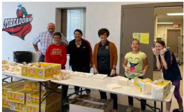
Rotarians serving food at last Thursday's Literacy Night at Franklin