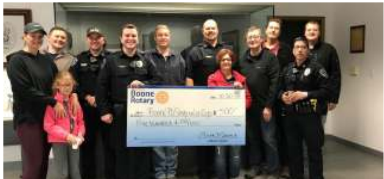
Presenting a "big check" to members of the Boone Police Department to support Shop with a Cop