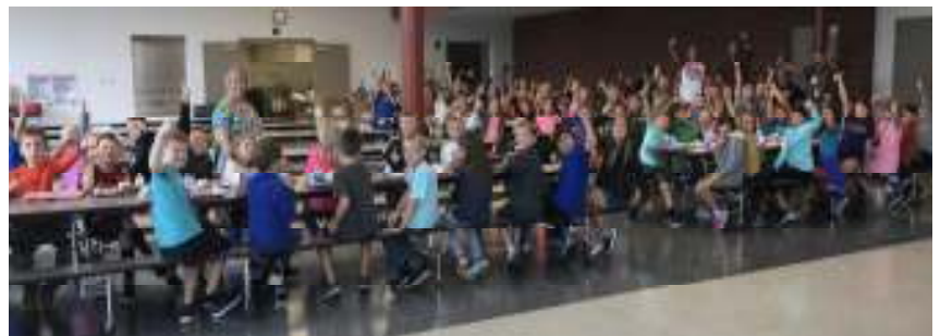
Happy Franklin 3rd Graders celebrating receiving their new dictionaries!